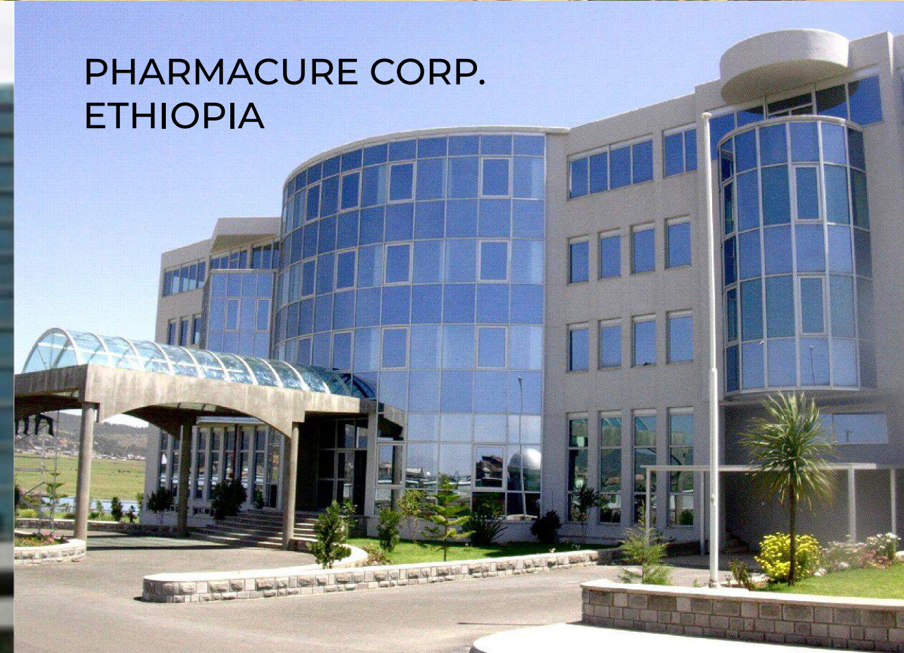
PHARMACURE CORP. ETHIOPIA