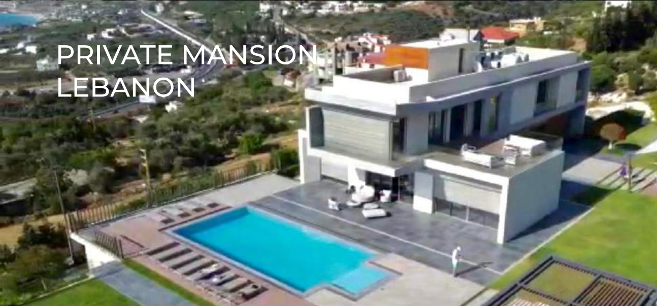
PRIVATE MANSION LEBANON