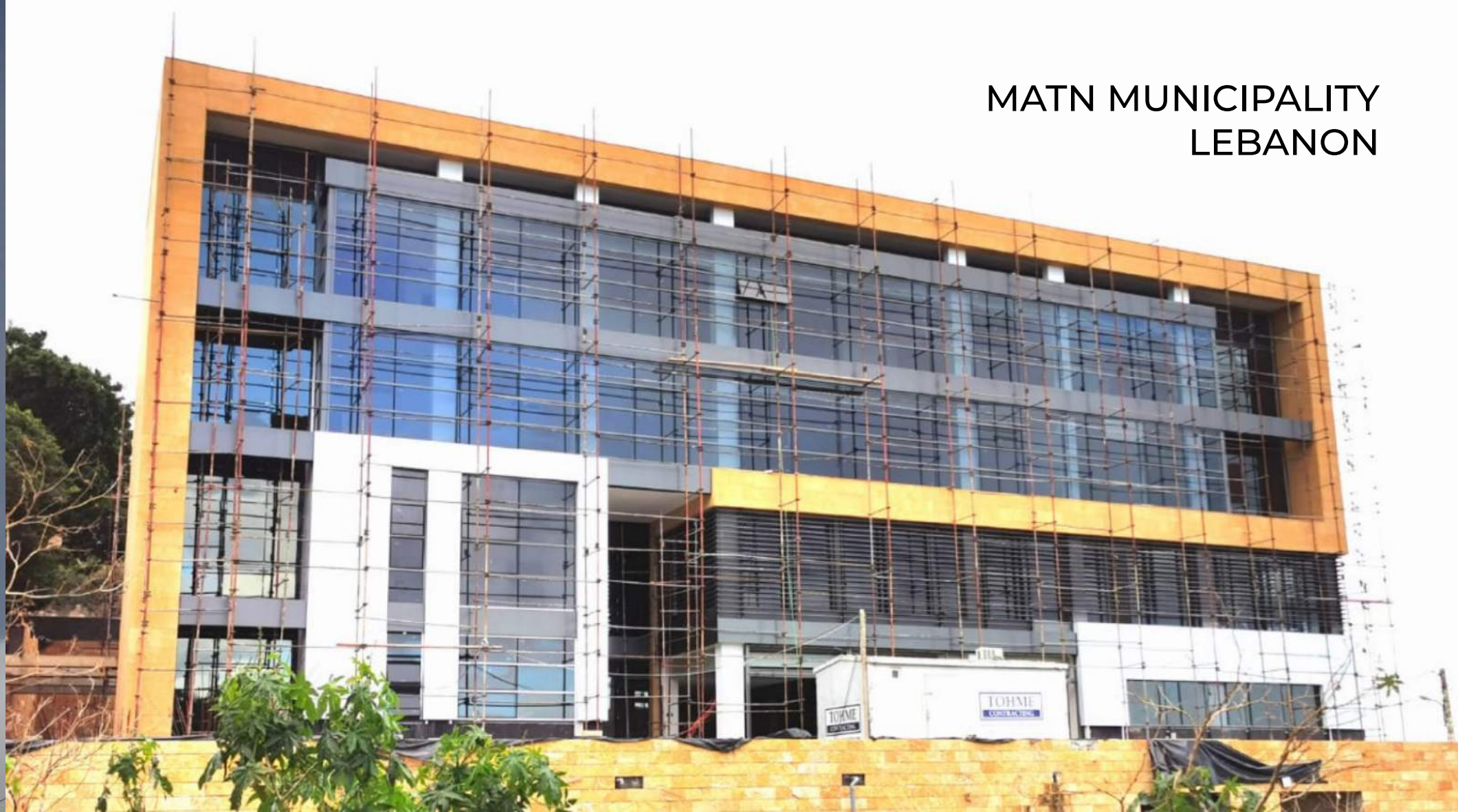
MATN MUNICIPALITY LEBANON